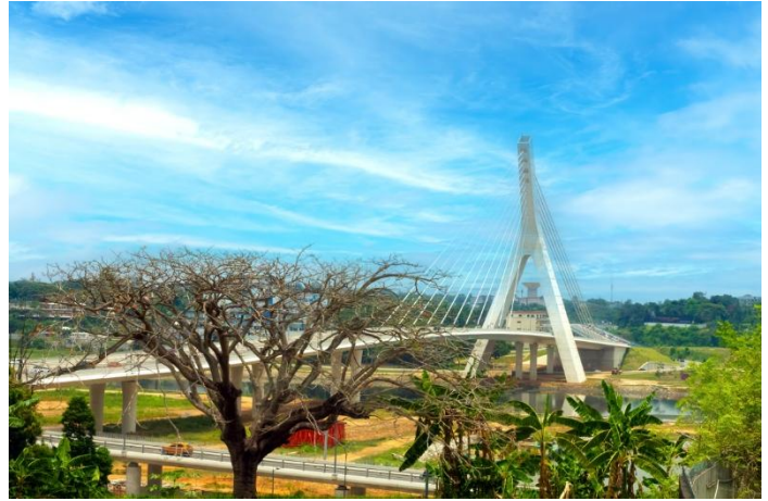
Pont de Cocody (Cocody Bridge), Abidjan, Côte d'Ivoire

After issuing labeled bonds in 2024 ( $1.1 billion sustainability bond in 2024 , and ESG Samurai Bond in 2025 ), Côte d'Ivoire explored complementary financing approaches beyond use-of-proceeds instruments to address economy-wide